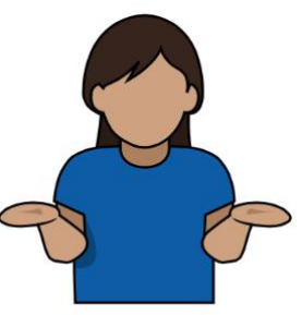
5. Accepted "Accepted" Forearms extended in front of body, elbows tight against torso with palms facing upwards