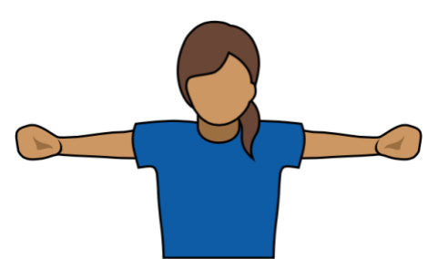
20. Personnel Ratio: Female Matching "Ratio: Female Matching" Arms extended to side, hands closed in a fist