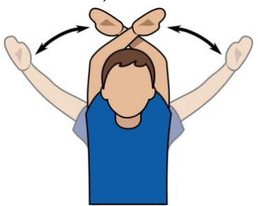
21. Play has stopped

Wave both extended arms crosswise overhead