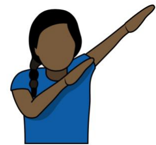
24. Match Point "Match Point" Both arms pointing straight up to the left, palms facing down

Wave both extended arms crosswise overhead