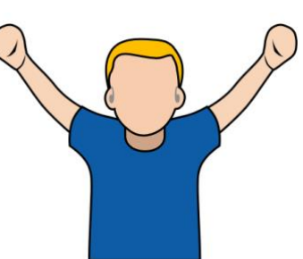
2. Violation "Violation" Hands above head forming a V, closed fists

Arms raised, elbows bent, fists facing head