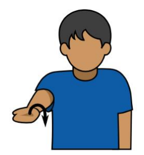
13 Turnover "Turnover" Right arm extended in front of body, palm facing up and then rotate to palm facing down