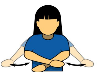
6. Retracted "Retracted" Sweeping crossover motion with both arms extended down in front of body