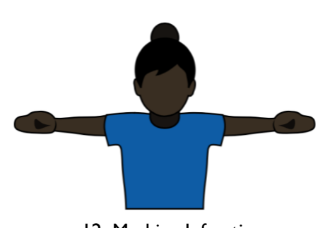
12. Marking Infraction "Fast Count" "Straddle" "Disc Space" "Wrapping" "Double Team" "Vision" Arms extended to side, palms facing front

Closed fists, rotate wrists around in a vertical circle